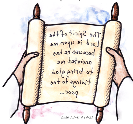
Luke 1.1-4; 4.14-21

Third Sunday in Ordinary Time January 23rd, 2022