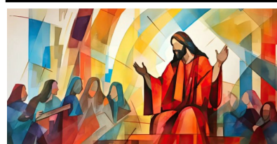
Jesus teaching in the synagogue. The 4th Sunday in OT Year B.

Mass Intention Requests - Please complete a mass intention envelope (found in the church porch), with de- tails and your donation. Thank you.